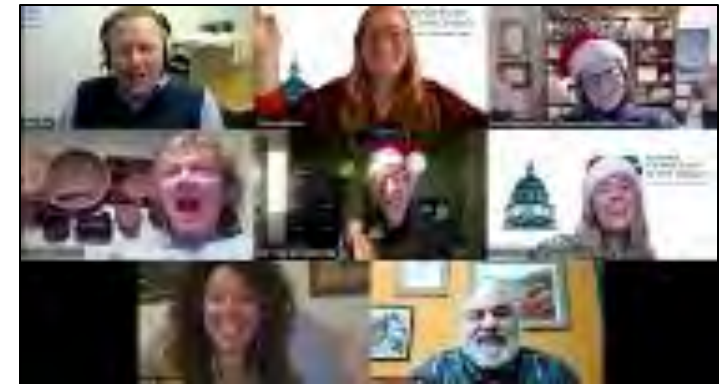
Some of the NSAC Board of Directors