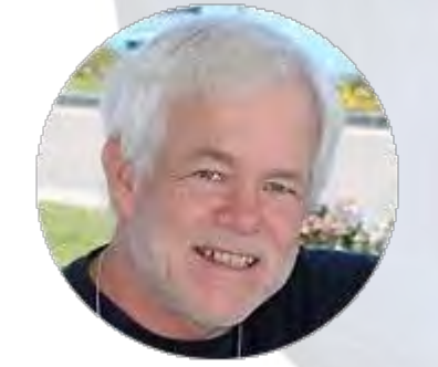
Paradise Recreation & Parks District