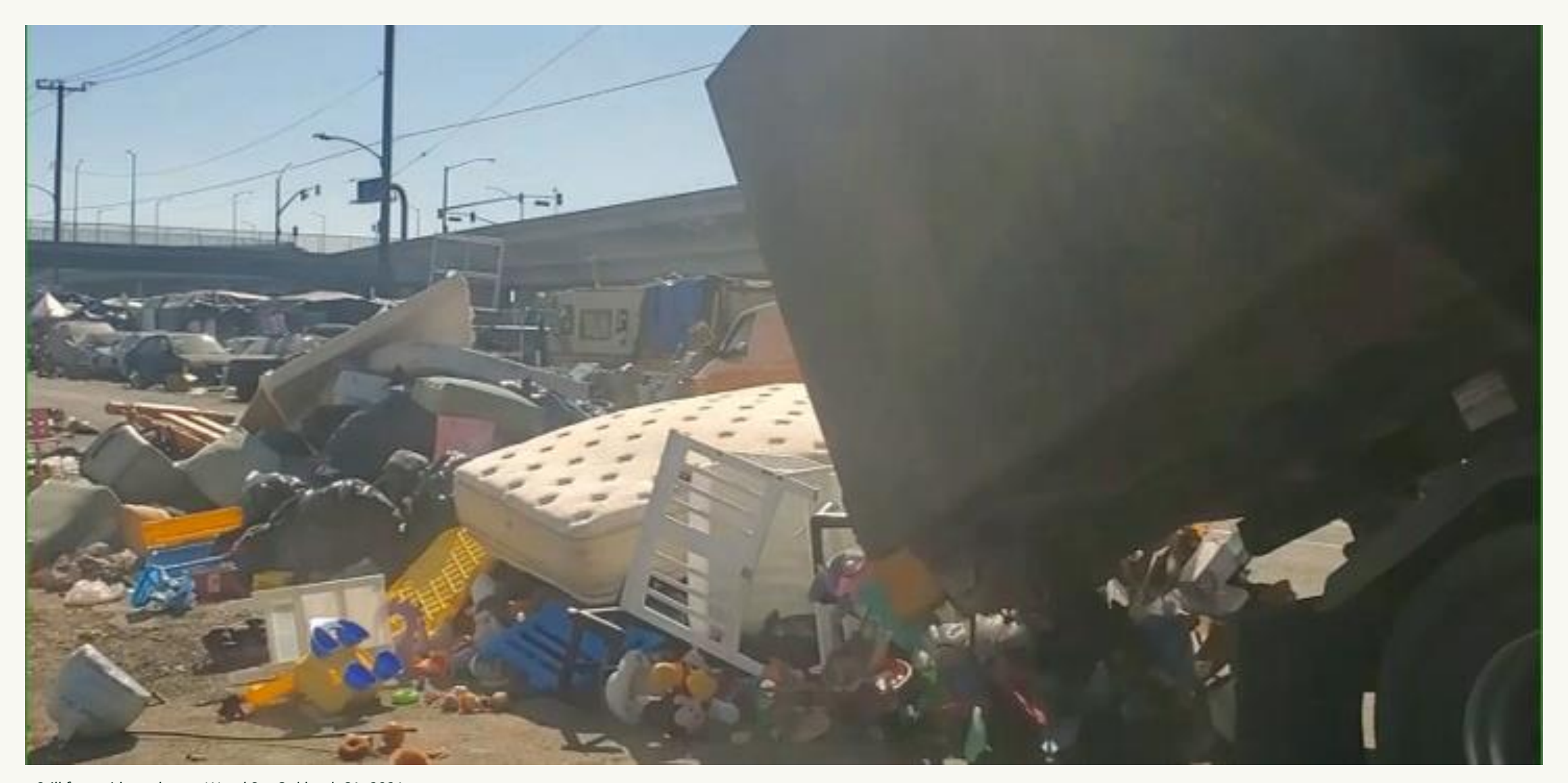
Still from video taken at Wood St., Oakland, CA, 2021