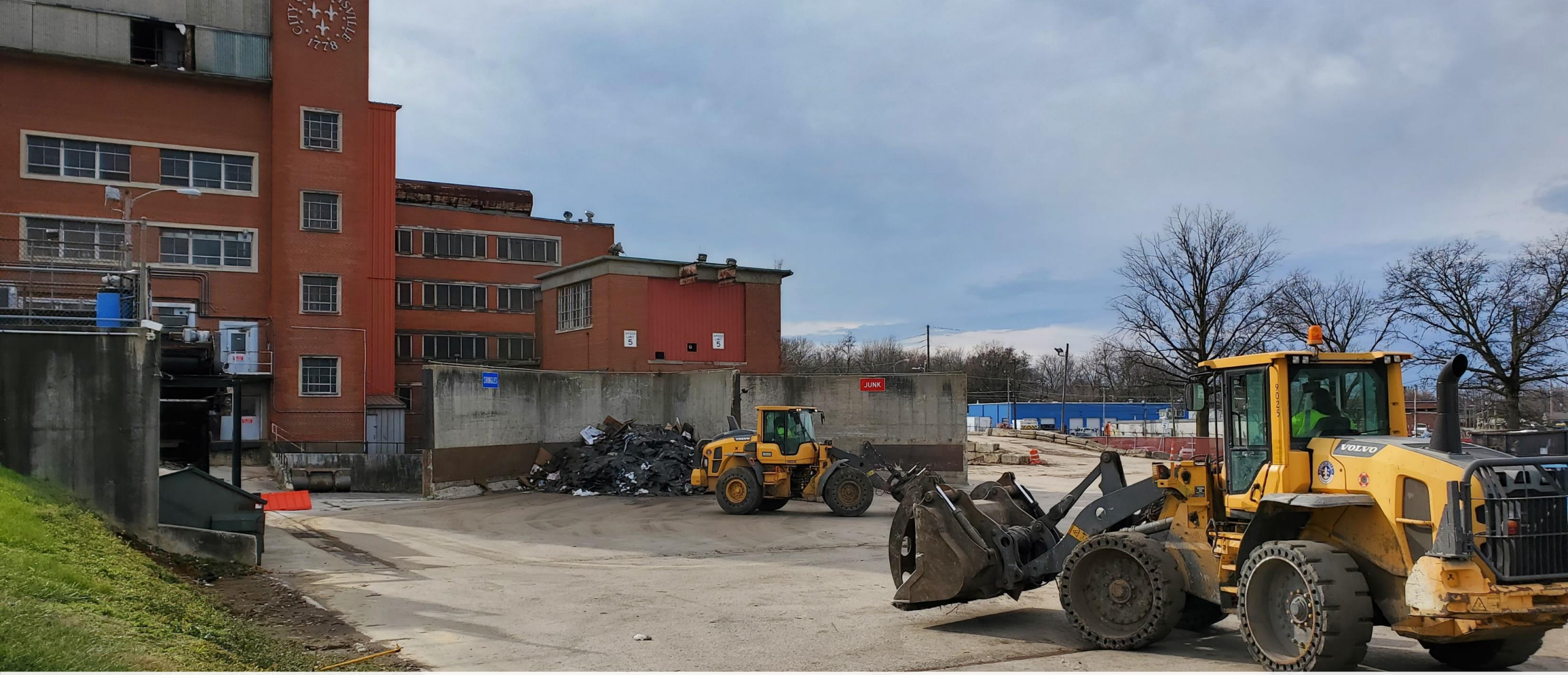
Waste Reduction Center